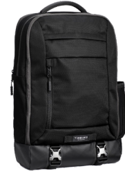
TIMBUK2 - AUTHORITY FOR DELL - 15"

The Evolve 75 is a wireless headset with superior Active Noise Cancellation and integrated busy-light to enhance your productivity.