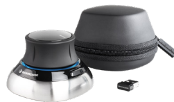
3DCONNEXION SPACEMOUSE WIRELESS

Enjoy a revolutionary 49-inch dual QHD curved monitor with ultra wide views, multitasking features and seamless USB-C connectivity for an immersive work experience.