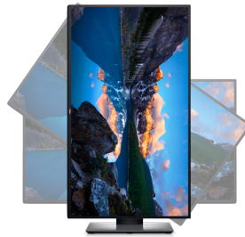
DELL ULTRASHARP 27 4K MONITOR WITH PREMIER COLOR | U2720Q

Work at full speed with Dell's powerful Thunderbolt Dock. Charge your system faster, support up to three 4K displays and connect to your peripherals via a single cable.