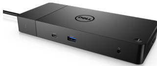
DELL THUNDERBOLT™ DOCK | WD19TB

Work at full speed with Dell's powerful Thunderbolt Dock. Charge your system faster, support up to three 4K displays and connect to your peripherals via a single cable.