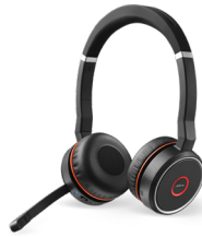
JABRA EVOLVE 75

Connect your Precision to almost any device with a convenient 6-in-1 compact adapter, to collaborate from any location.