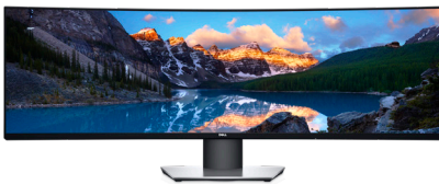
DELL ULTRASHARP 49 CURVED MONITOR | U4919DW

Enjoy a revolutionary 49-inch dual QHD curved monitor with ultra wide views, multitasking features and seamless USB-C connectivity for an immersive work experience.