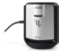
X-RITE COLORIMETER iDISPLAY PRO

3Dconnexion's patented 6-Degrees-of-Freedom (6DoF) sensor is specifically designed to manipulate digital content or camera positions in the industry-leading CAD applications. Simply push, pull, twist or tilt the 3Dconnexion controller cap to intuitively pan, zoom and rotate your 3D drawing.